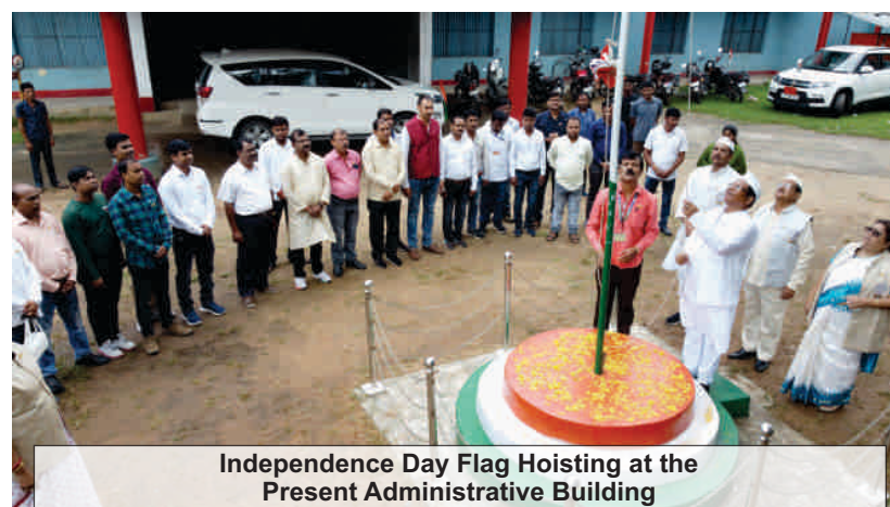
Independence Day Flag Hoisting at the Present Administrative Building

for their motherland. He exhorted all to rededicate ourselves to the service of the nation.