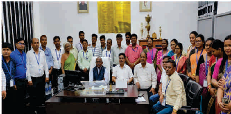
NAAC Peer Team at the College