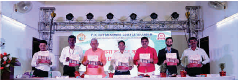
Foundation Day Event at P. K. Roy Memmmorial College, Dhanbad

P. K. Roy Memorial College, a constituent unit of the B B M K University, Dhanbad celebrated 65 glorious years of its establishment in the month of July 2022. College was established by philanthropists Roy family of Katrasgarh on 20th July 1957. The college has been part of Ranchi University, Ranchi and then Vinoba Bhawe University, Hazaribagh. When Binod Bihari Mahto University was carved out of VBU, P K Roy Memorial came under the ambit of this University.