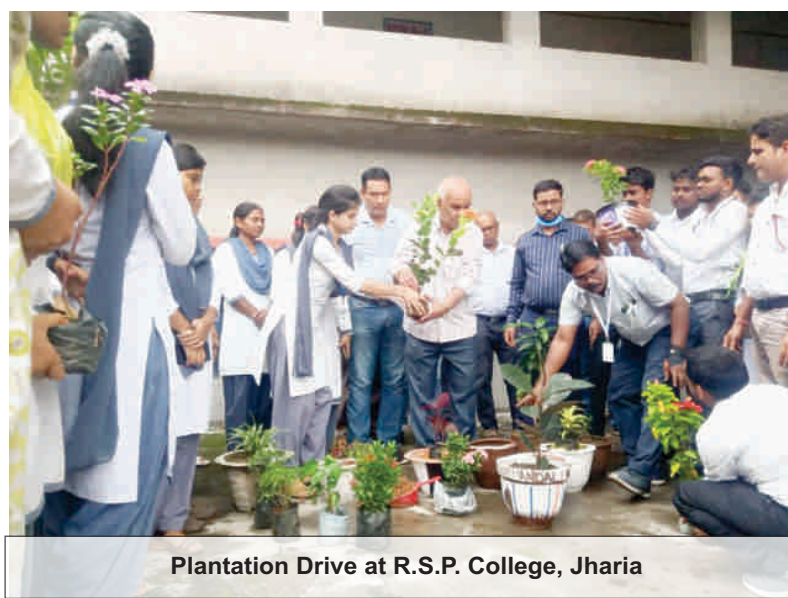
Plantation Drive at R.S.P. College, Jharia

the foundation for the 1857 First War of Independence. The tribal revolts such as Dhal Revolt, Pahadia Revolt, Tilka Movement, Tamar Revolt, Chero Movement, Ho Revolt, Kol Revolt, Bhumij Revolt, Santhal Revolt, Sardari Movement,