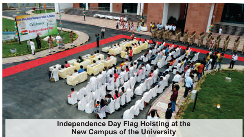
Independence Day Flag Hoisting at the New Campus of the University