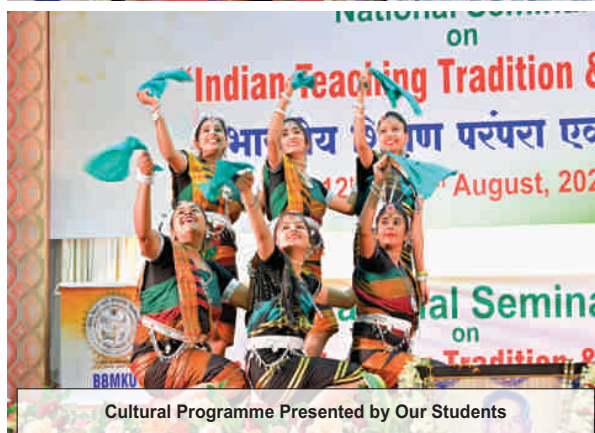
Cultural Programme Presented by Our Students