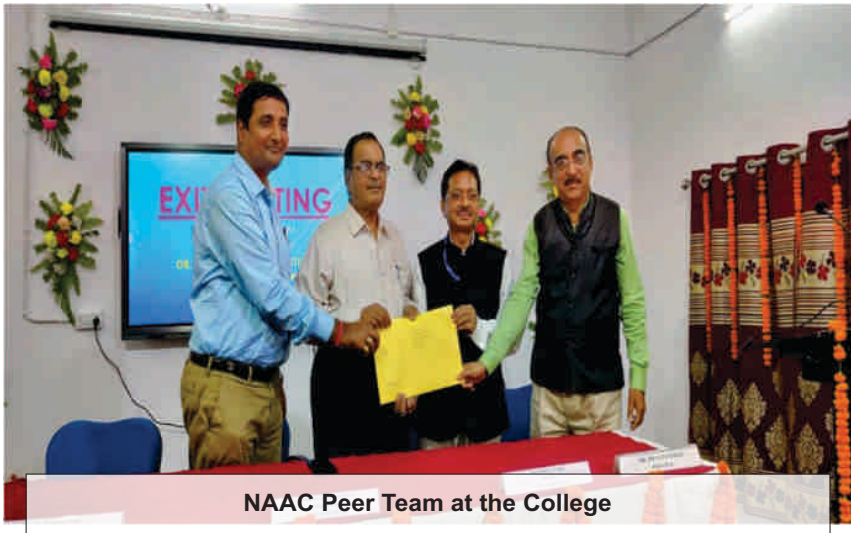
NAAC Peer Team at the College