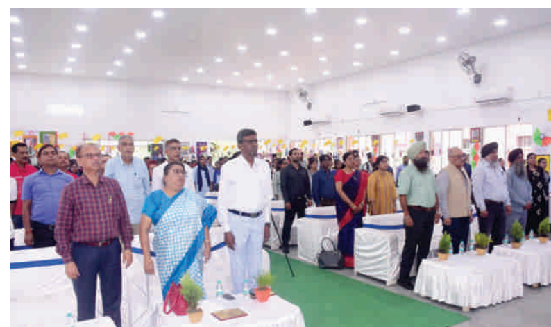
Inaugural Programme of the Book Fair