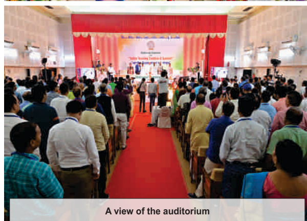
A view of the auditorium